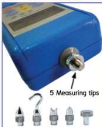
5 Measuring tips