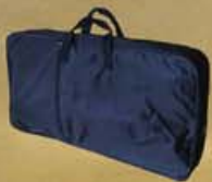
Condura Plastic carrying bag for all the equipments

When metals remain under the ground for a long time, in the pace of time they establish a magnetic field and these magnetic fields radiate as transmitters meaning, the receiver of the search coil ensures detection of the same target in 3 to 4 times deeper.