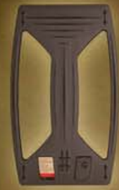
Deep Search Coil