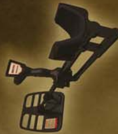
General Search Coil