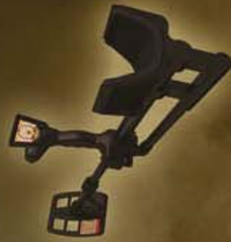
Surface Search Coil