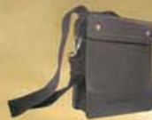
System box leather bag