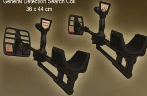
General Detection Search Coil 36 x 44 cm