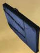
Double zippered Condura plastic carrying bag reinforced for deep search coil